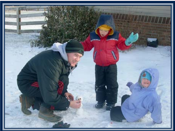
Playing in the Snow

We love the simple things in life to share with our children. Tickle sessions on the floor, board games on a rainy day, "horsey" rides in the yard, picnics in the park and feeding the ducks at the pond, and evening walks with our dogs are just some of the simple activities we share with our children. We also enjoy playing sports together like basketball, soccer, waffle ball or football. Of course, we don't always play according to the rules, but to learn the skills of the game and to have fun. We have a membership at our local pool and spend many days of the week there during the summertime. We also have memberships to our local zoo and enjoy spending the day at the zoo several times throughout the year as well.