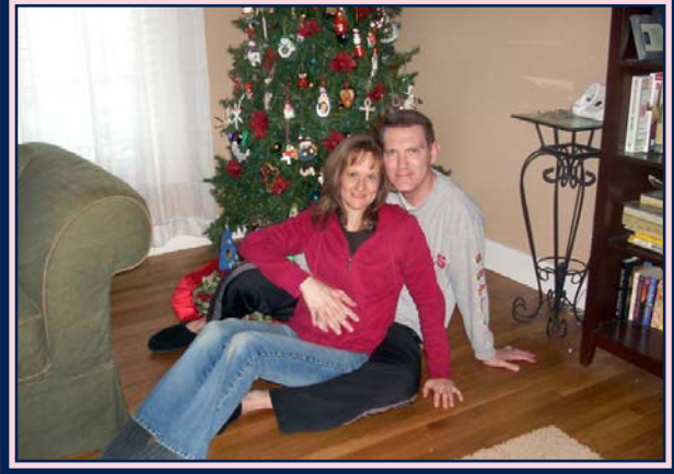
Ralaxing During the Holidays