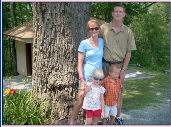
Vacation at Gatlinburg, TN