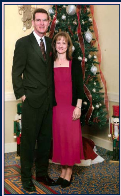
Holiday Party Time