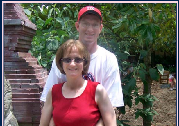
Fun Day at the Zoo