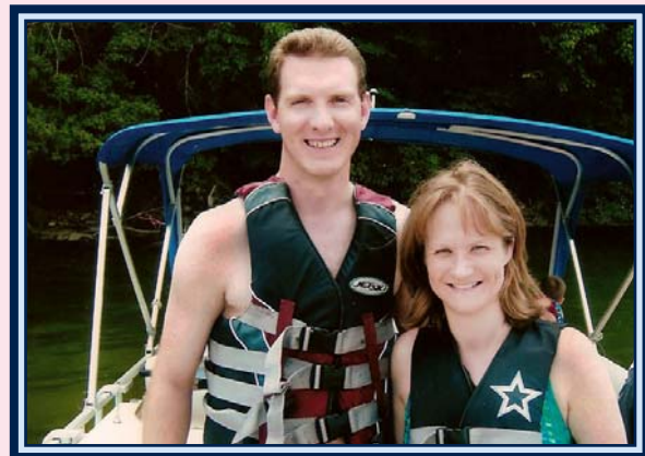
Out for a Boat Ride