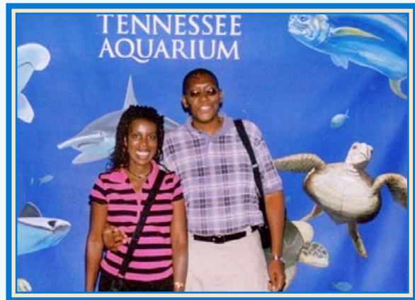
Vacationing in Chattanooga (at the Tennessee Aquarium)

With this in mind, we look forward to providing the very best education to your child. We intend to encourage and support him or her to pursue the desired career relative to his / her interests and strengths. Our goal is to encourage your child to pursue his / her dreams, with the sky being the limit. We will give you child the gift of education with the realization that this will stay with him or her forever and no one can take this away from him or her. At an appropriate age, we plan to travel widely with your child and involve him/her in service opportunities - both locally and internationally.