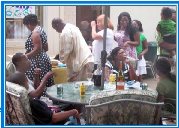
Vacation Family Cookout