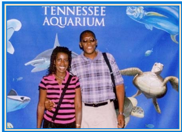
Vacationing in Chattanooga (at the Tennessee Aquarium)

With this in mind, we look forward to providing the very best education to your child. We intend to encourage and support him or her to pursue the desired career relative to his / her interests and strengths. Our goal is to encourage your child to pursue his / her dreams, with the sky being the limit. We will give you child the gift of education with the realization that this will stay with him or her forever and no one can take this away from him or her. At an appropriate age, we plan to travel widely with your child and involve him/her in service opportunities - both locally and internationally.