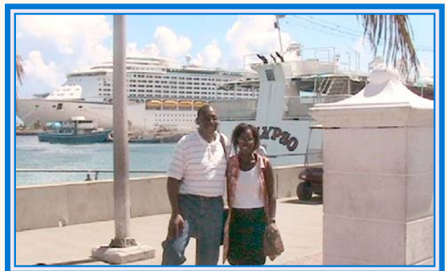
Cruising in the Bahamas

We also love to exercise regularly at home or at a fitness center. We engage in a wide range of physical activities including aerobics, Zumba fitness dancing, weight-lifting, 5K runs, swimming etc. Our house is on a hill and together with our neighbors - we love to take walks up and down the hill in the evenings - enjoying fresh air and nature. Engaging in such activities is exhilarating for us and it helps to keep our bodies in good health. We look forward to introducing your child to a healthy and fit lifestyle.