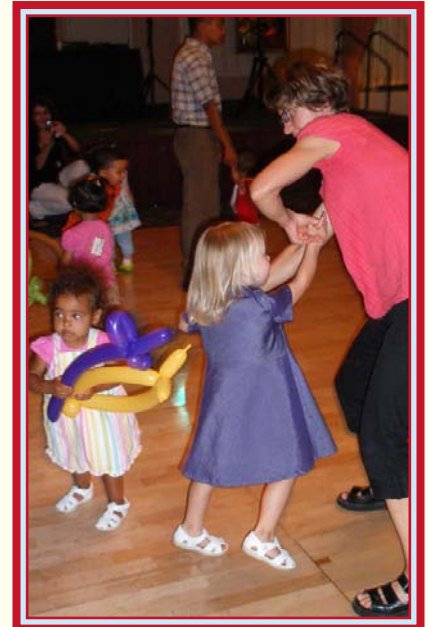
Dancing the Night Away