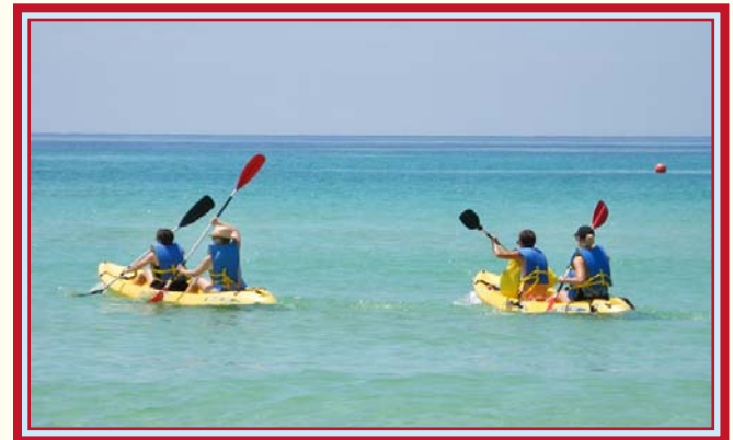
Sea Kayaking with Friends