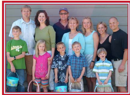
Easter Egg Hunt with Cousins