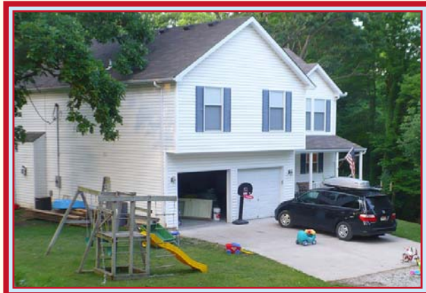
A View of Our Home from the Mailbox