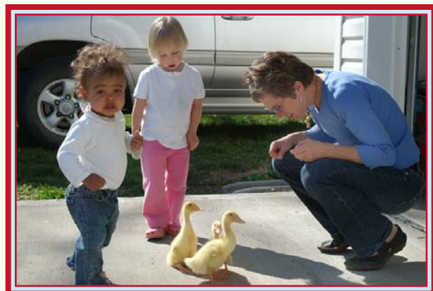
Raising Ducks Is a New Experience