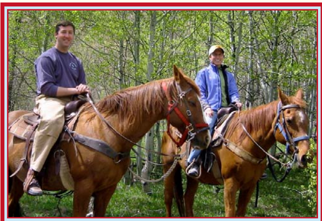
Horseback Riding is a Treat