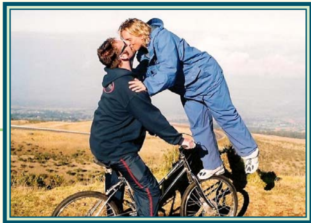
Kisses on Top of a Volcano in Hawaii