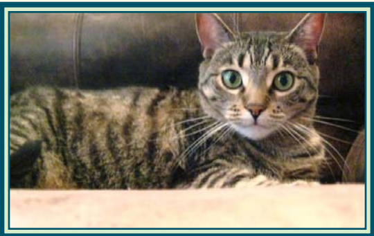
Our Kitty ...Gracie

Gracie. She is fun-loving, playful and frequently makes us laugh! We are part of a relatively small school district where children can be a part of many activities and get the extra attention they deserve.