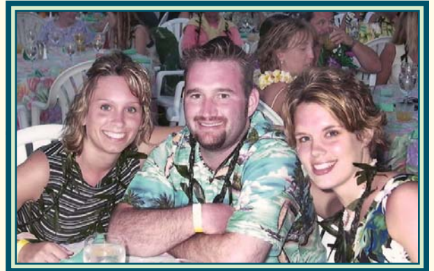
Enjoying a Hawaiian Tradition, the Luau