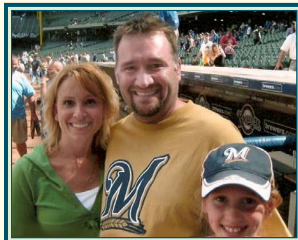
At the Milwaukee Brewer's Baseball Game