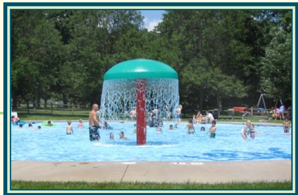
Our Local Wading Pool