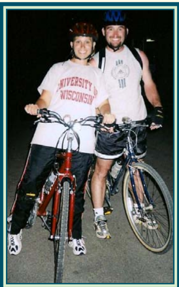
A Bike Ride We Participated in for Charity