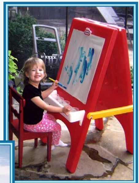
Our Budding Artist