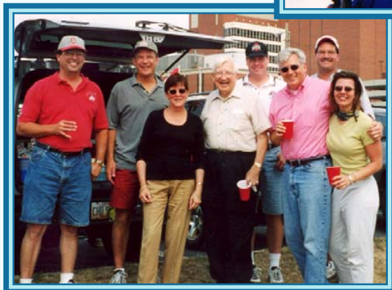
Tailgating at a Buckeye Game