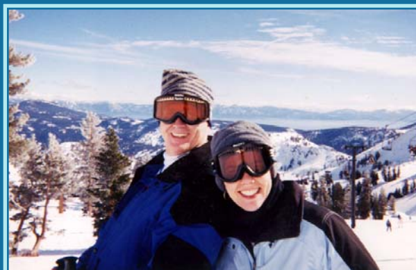
Skiing at Lake Tahoe