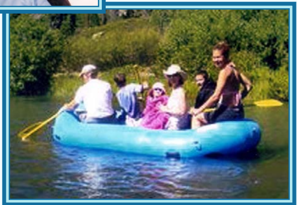
River Rafting at Lake Tahoe