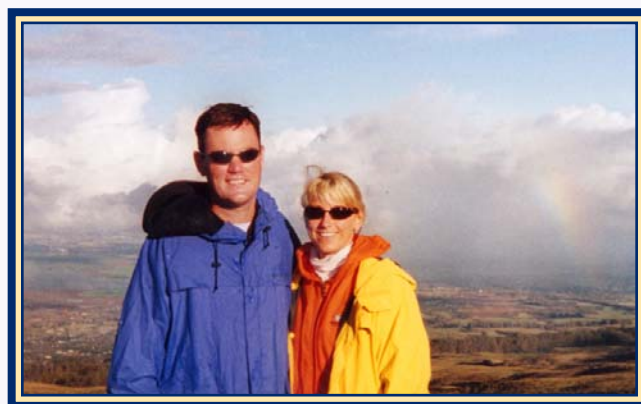
Needs a Caption