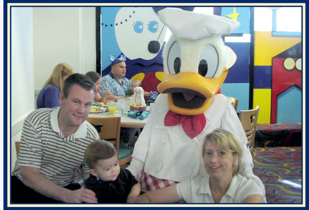
Breakfast at Disney with Donald Duck

We look forward to sharing these same special moments with your child. We will provide them with the same strong morals and values that were modeled into us by our parents. We believe that a strong education is of the utmost importance and we will ensure that your child has the skills necessary to be a success at whatever they want to be!