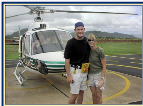
Helicopter Tour of Hawaii

We chose the town that we live in with children in mind. Our town sponsors numerous family events throughout the year such as town fairs, pancake breakfasts, movie nights and the yearly breakfast with Santa, which is always a big hit! We are surrounded by beautiful parks and playgrounds which is a big meeting area for the families to get together. We are conveniently located about 1 1/2 hours from the beach and only thirty minutes from New York City.