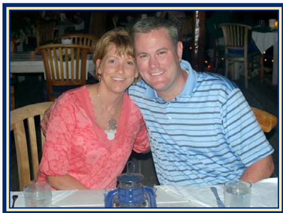
Needs a Caption