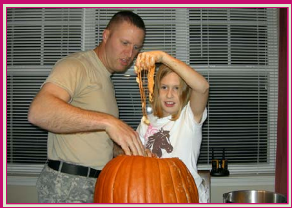
Carving Pumpkins is a Holiday Tradition We Share Every Year