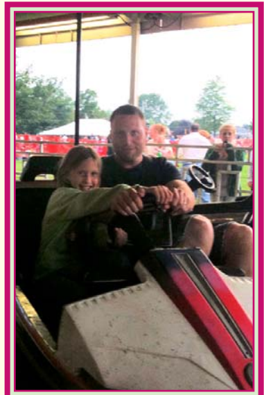
Our Hometown Has an Annual 4th of July Carnival!

We live on a military installation which houses thousands of families. It is a rural area just a few hours away from the beach. We have a very large house with spacious rooms, including four bedrooms, and all of the amenities of home. Our side of the duplex is 2200 square feet. There are kids of all ages to play with in our tight knit community. Our post has an activity center in every neighborhood. They have basketball courts, game rooms and a movie theater. There is also a pool with a walk in area for the little kiddos to play. We have access to a community center that offers dance lessons, gymnastics, music lessons and karate among other activities. We can go shopping, play tennis, run around a track, go see a movie, play at the park or take our dogs to the dog park without even leaving post. We also enjoy driving out to the drop zones to watch the Army guys jump out of airplanes. The military is a very close knit group of people who are willing to help and give support when needed.