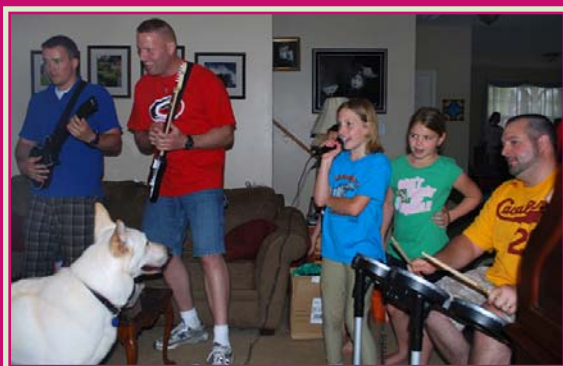
Summer Parties and Rock Band Are Activities We Enjoy with Family and Friends