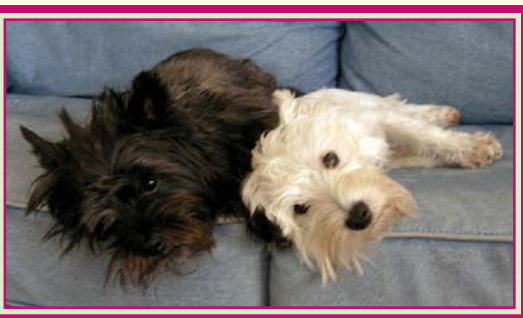
These Are Our Dogs, Dorothy and Oz