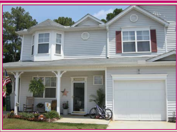
We Live in a Duplex on a Military Installation