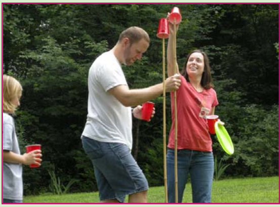
A Game Dealing with a Frisbee, Bamboo Sticks and Red Cups HAS to Be Fun!