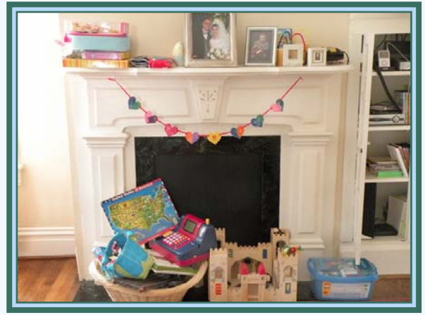
The Mantle in Our Living Room