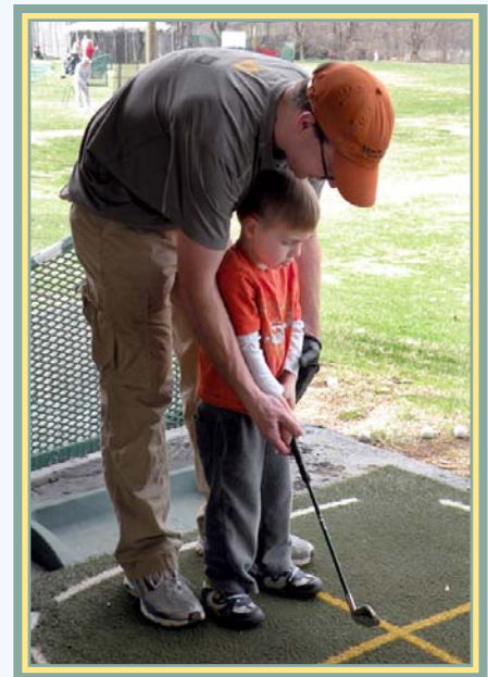
At the Driving Range