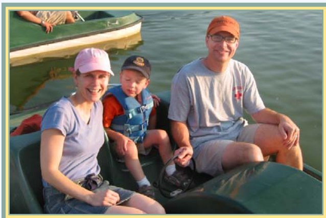
Family Paddle Boat Ride