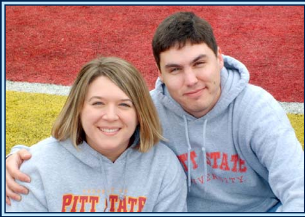
On the Field at a Football Game