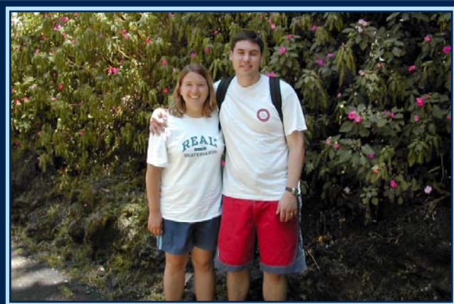
Trip to Hawaii