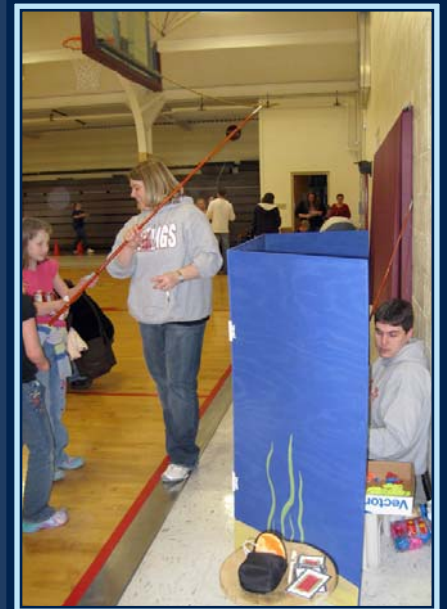
Working the Fish Pond at the School Carnival