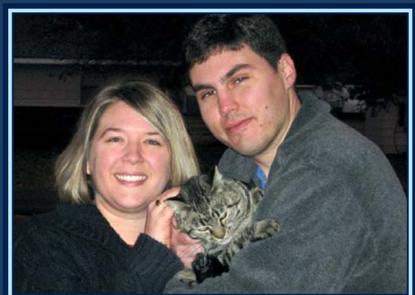
Holding Mr. Whiskers