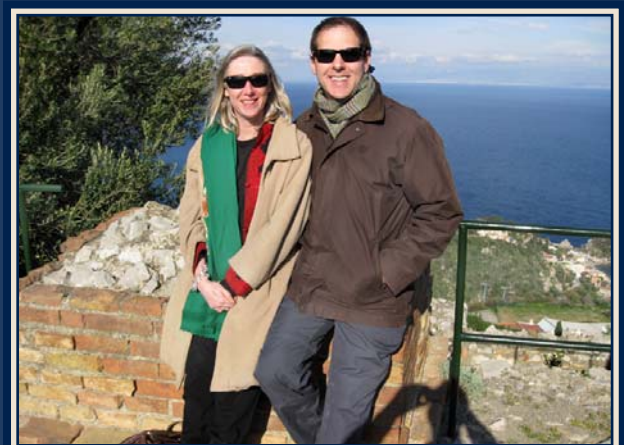
Vacation in Sicily