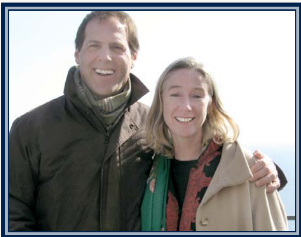
Vacation in Sicily, Taormina