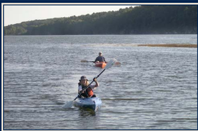
Kayaking in Maine