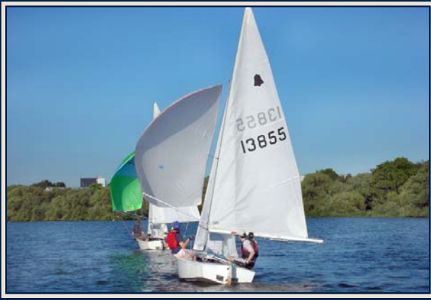
GP14 Worlds, Abersoch